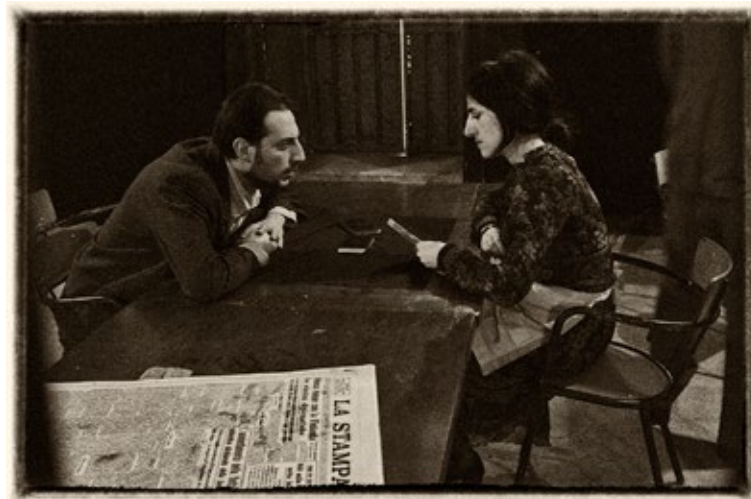
La fiera di San Martino.